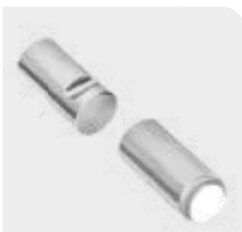
Hook and buffer