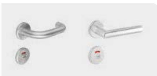
Handle-sets U-shaped or L-shaped