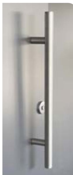
Handlebar round 2 pieces per door