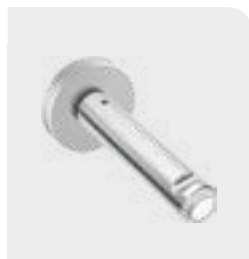
Hook with buffer